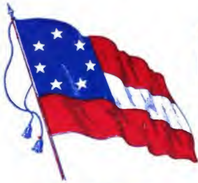
THE STARS AND BARS.

First flag of the Confederate States, adopted by the Congress at Montgomery, Ala., and raised at the capitol, March 4, 1861, by the granddaughter of President John Tyler.